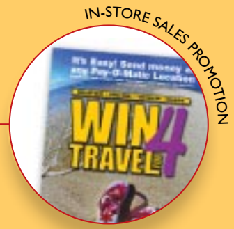
IN-STORE SALES PROMOTION