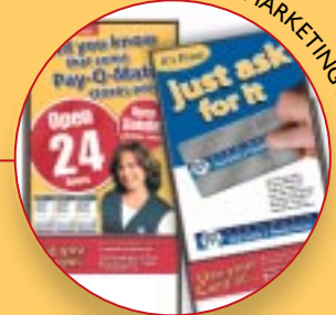
IN-STORE MARKETING SIGNAGE