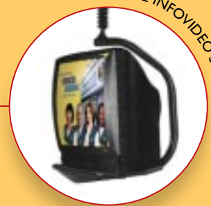
IN-STORE INFOVIDEO SYSTEM