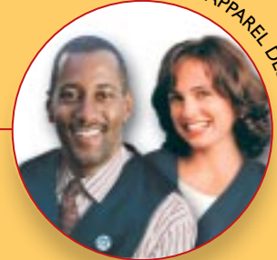
EMPLOYEE APPAREL DESIGN